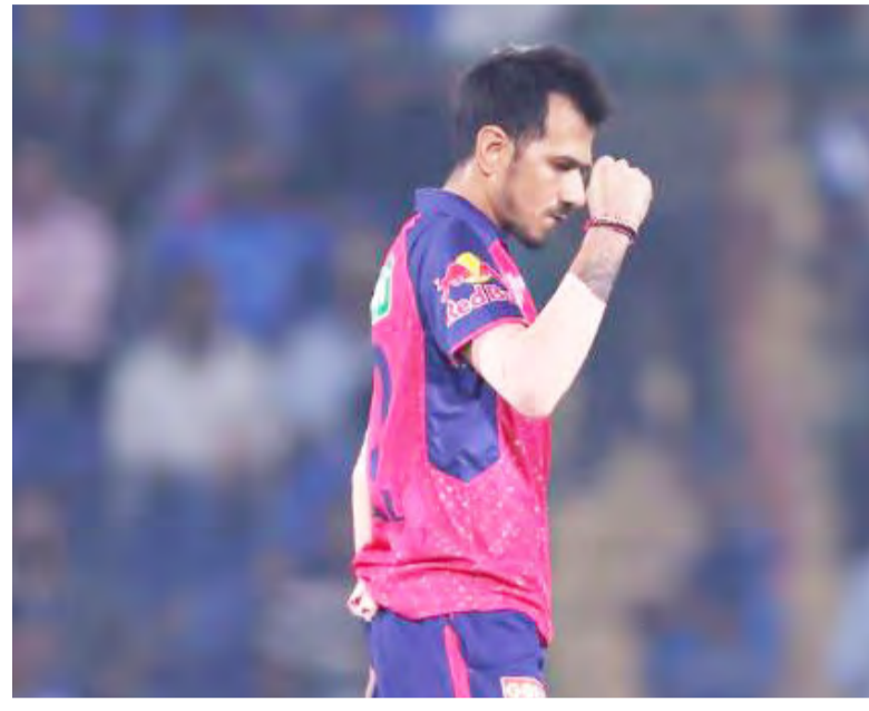
an enthralling finish as DC pulled off the match in an high-octane encounter.