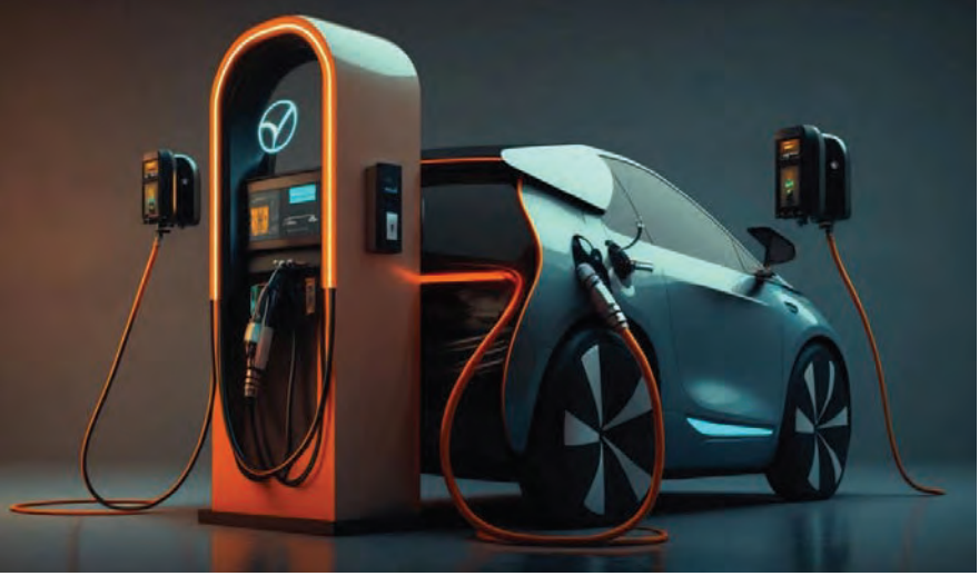
gating the higher costs associated with adopting new

The PLI scheme offers a government grant of 13-15 percent of the annual sales value of EVs to automakers. which has been instrumental in driving sales and miti-