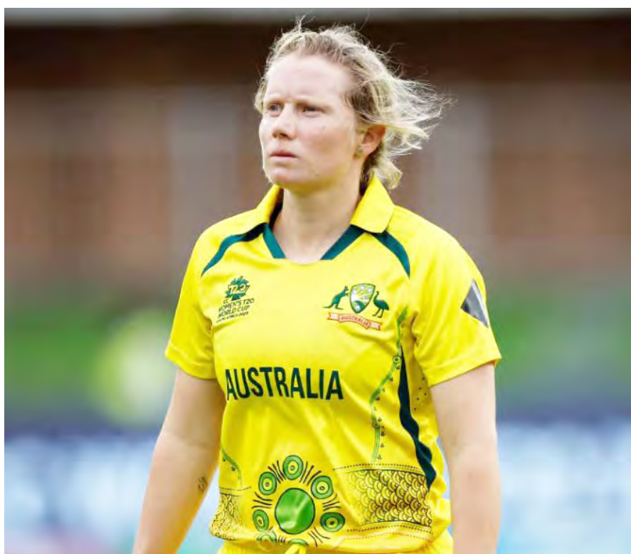
and player. "Being skipper as well is a fairly big role for me. I want to be available for

In November, Healy expressed reservations about her full availability for the ongoing cricket season, citing her dual roles as captain