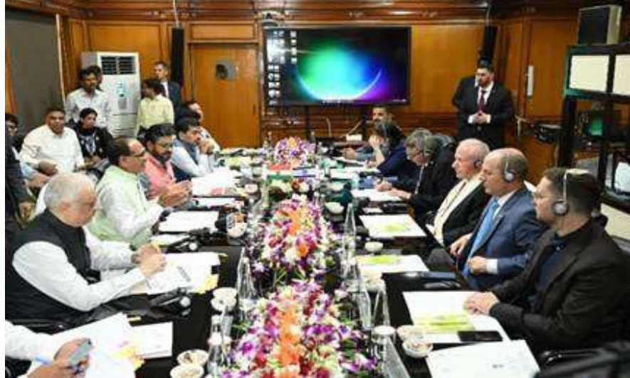
farmers in India. Shri Shivraj Singh Chouhan reiterated India's