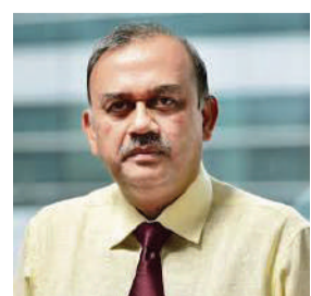
praised the energy and verve of the bank's middle and ju-