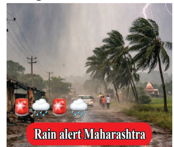
Rain alert Maharashtra

Meanwhile, hot and humid weather conditions are expected to persist in the Konkan region. The IMD has also warned of a possible heatwave in Mumbai, Thane, Palghar and Raigad districts. Temperature fluctuations were recorded across the state, with the