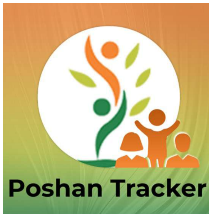
for effective usage of the Poshan Tracker Application and resolution

Block and District coordinators provide on-ground handholding support to AWWs and supervisors