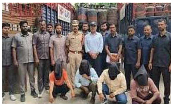
the agency was allegedly involved in storing cylinders far beyond the permissible limits.

An additional 68 empty cylinders were found stored inside the office premises.