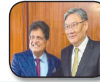
Piyush Goyal meets with Chinese counterpart Wang Wentao over trade cooperation