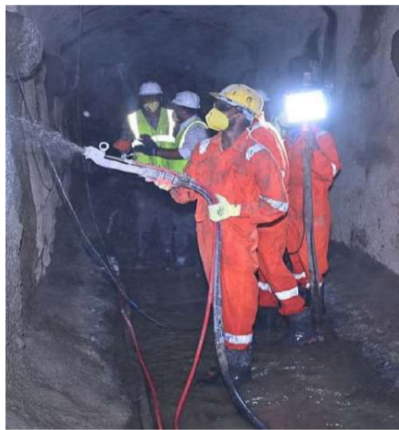
Mumbai has long struggled with waterlogging during the monsoon season, particularly in low-lying areas.

These drains have been identified as key points in the network that are vulnerable to blockages and flooding.