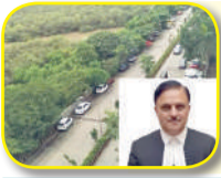
Former Judge Slams Massive Mangrove Felling

PRGI No.- MHENG/25/A0943 | VOL - 1 | ISSUE 287 | 8 PAGES | ₹ 3.00