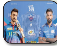
DC aim to rewrite history as MI look to extend their dominance