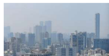
could pose health concerns, especially for sensitive groups.

This placed it firmly in the 'poor' category, suggesting that air pollution