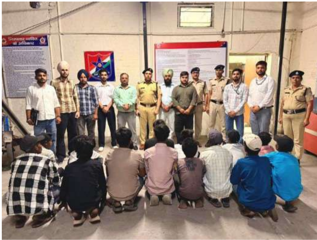
from 8 am to 8 pm and a contractor was waiting for them at Ludhiana railway station.

A joint team searched the train around 7.30 pm and safely rescued all 15 children. Around 10 of them were reportedly being taken to a rice mill in Ludhiana where they were promised a salary of Rs 10,000 per month. The children said they were expected to work