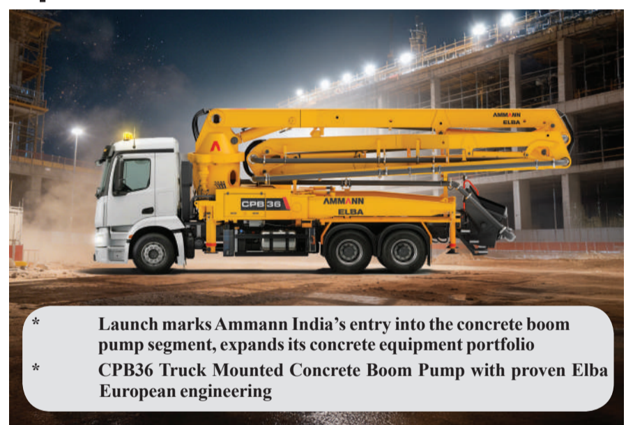
* Launch marks Ammann India's entry into the concrete boom pump segment, expands its concrete equipment portfolio * CPB36 Truck Mounted Concrete Boom Pump with proven Elba European engineering