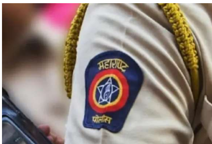
women. A case has been registered against all the accused under the NDPS Act related to narcotic drugs and psychotropic substances.

So far, police have arrested 13 people in the case, including two